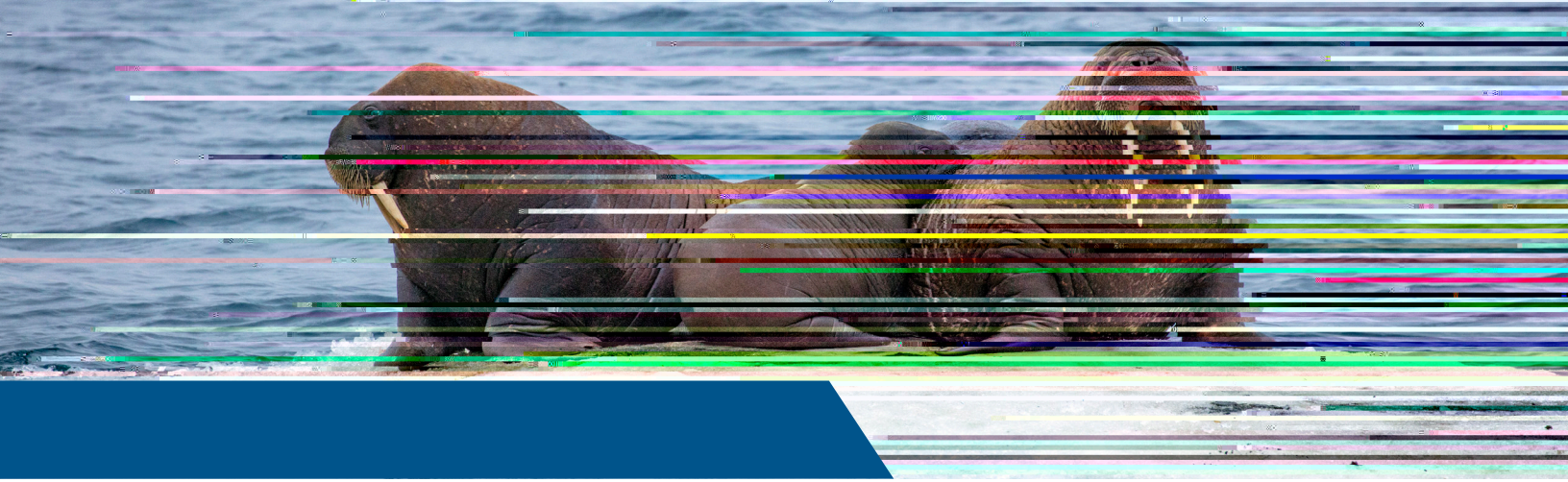
Walrus rest on sea ice in the Arctic.